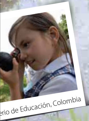
Ministerio de Educación, Colombia

The Sierra Gorda Earth Center Roberto Ruiz Obregón , within the Sierra Gorda Biosphere Reserve in Mexico, organizes courses and workshops for those who work for natural protected areas. It offers an online diploma course adapting the UNESCO “Teaching and Learning for a Sustainable Future” programme to local needs.